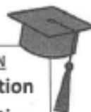
Photo & Text to relatives!